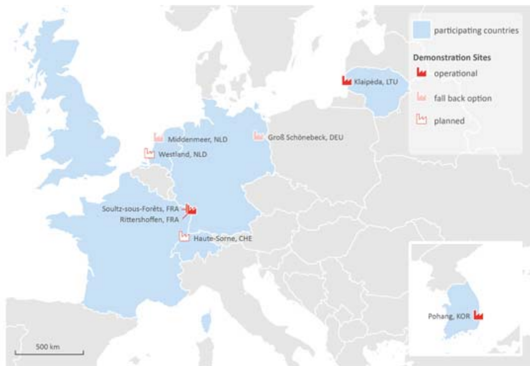
Participation countries and demonstration sites within DESTRESS.